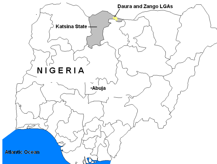
Map 1 Geographical location of the survey

Katsina State (including Daura and Zango LGAs) is part of the Northwest Millet and Sesame livelihood zone 4 which lies in a relatively arid ecology, the Sahel Savanna, with millet as the major food crop. With limited rainfalls, little fadama 5 land and the challenge of desertification and erosions, there is limited diversity in terms of diet, food and cash crops. Most of the poor households with limited landholdings heavily depend on markets for their foods as their household food reserves barely exceed 7 months.